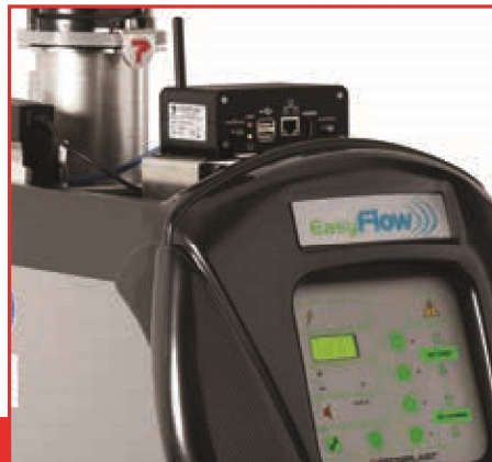
GATEWAY ENABLES THE ONE 2 ONE AND THE GUARDIAN